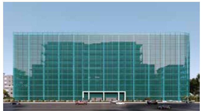
Tower E, Coimbatore

Each destination is thoughtfully crafted to balance sustainability and human experience. Natural light, integrated landscaping, and low-impact architecture come together to create spaces that feel open, calm, and connected.