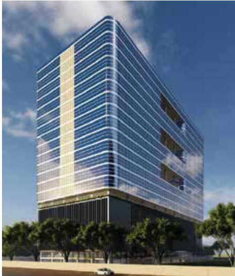
Tower C, Pune

Across Pune, Coimbatore, and Chennai, IndiaLand continues to reshape the way India experiences work, commerce, and community.